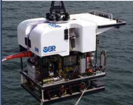
Top to bottom: The NOAA Ship Okeanos Explorer : America's Ship for Ocean Exploration; the control room onboard the Okeanos Explorer ; an octopus hiding; composite multibeam image of Tom's Canyon Complex; NOAA OER's new ROV, Deep Discoverer .